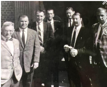
Boy's Phy Ed. Early 1960's