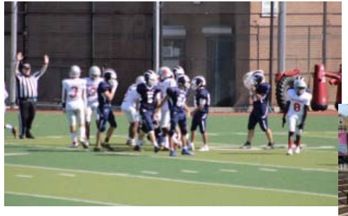
Raiders defeat Brooklyn Tech 38-0 on 9/25/2021

We again would like to thank all whose donations allowed us to award $30,500 in scholarships. Thanks to everyone who made a contribution. We are counting on our alumni to make thist year even better.