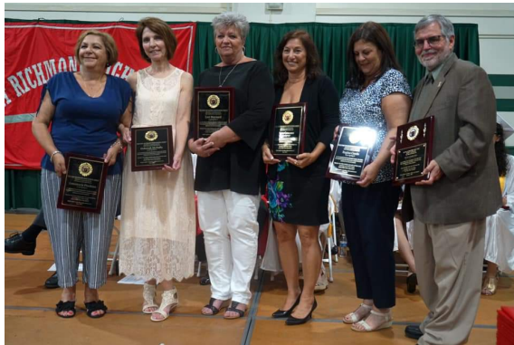
Retiring faculty and staff: