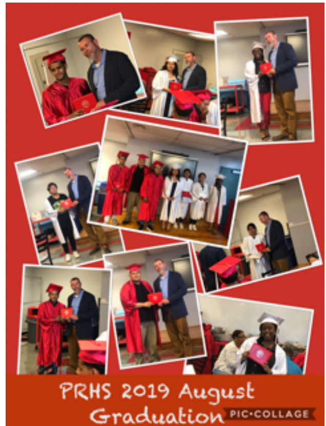
Congratulations August 2019 graduates